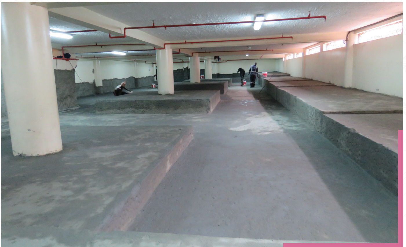
Ministry of Energy Kawi Complex Basement waterproofing