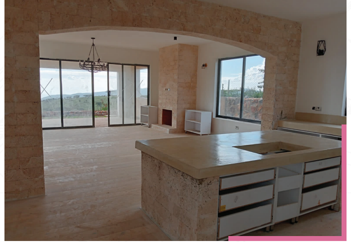
Private Residence Interior Decor