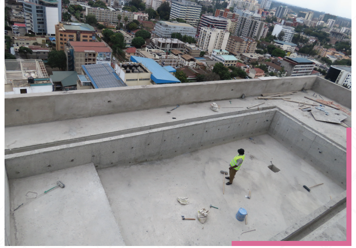
Elite Residences Rooftop, basements and Lift pits Waterproofing Nairobi Westlands