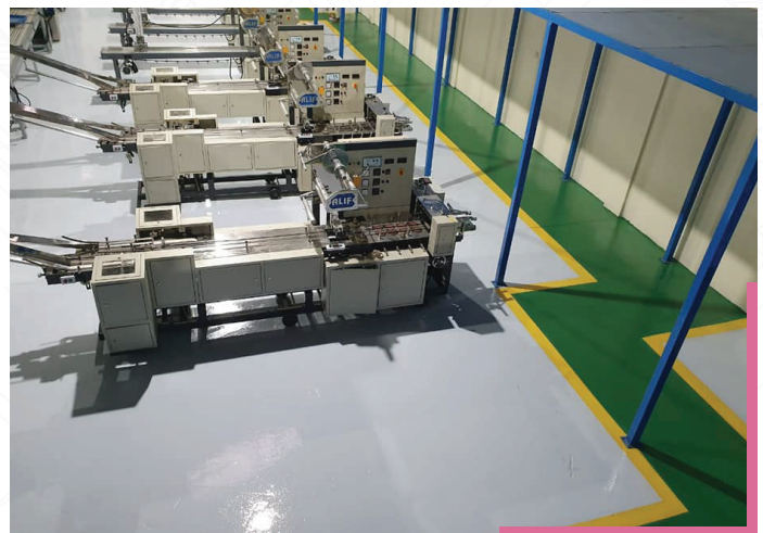
Factory Epoxy Floor Nairobi Industrial Area