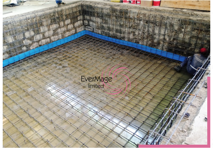
Royal Converters Factory (Manufacturers of Hanan) Machine pit waterproofing Nairobi Industrial Area