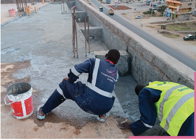
Woodville Centre - Joska Machakos Waterproofing Services - Wet areas Flatroof & Basements