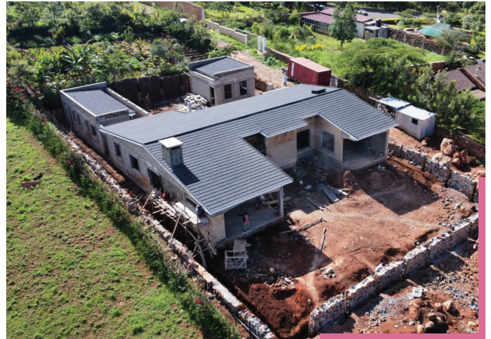
3 Bedroom Residential Unit With DSQs Kiserian Kajiado County