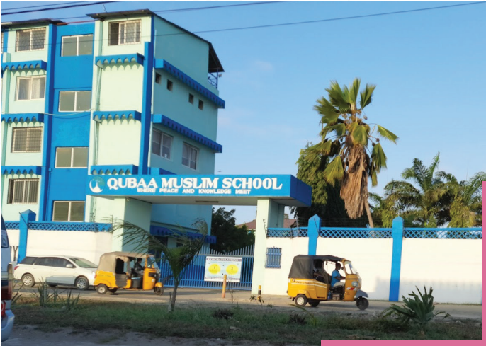
Qubaa Muslim School Exterior Paint works