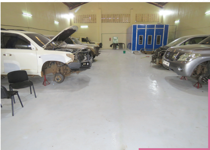
Stealth Auto Garage Epoxy Floor Epoxy Floor