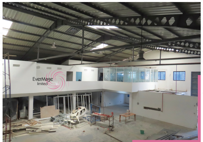
Spearhead Go down General renovations Nairobi Industrial Area