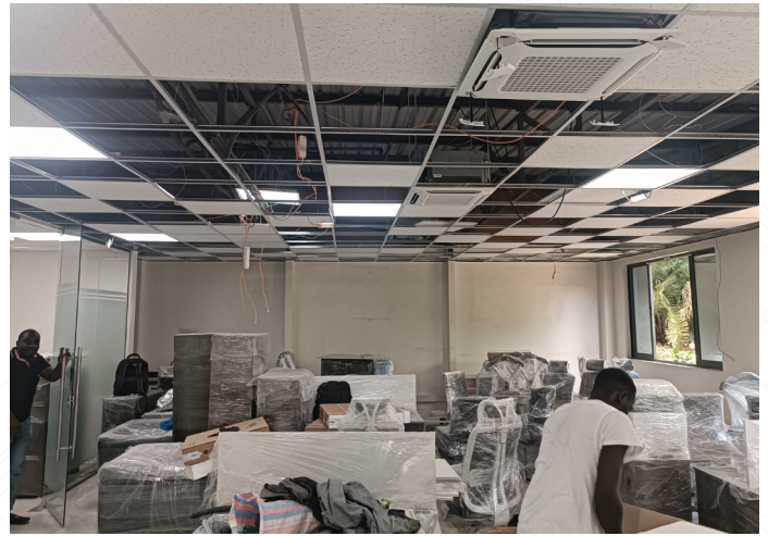
General office renovations Nairobi Westlands