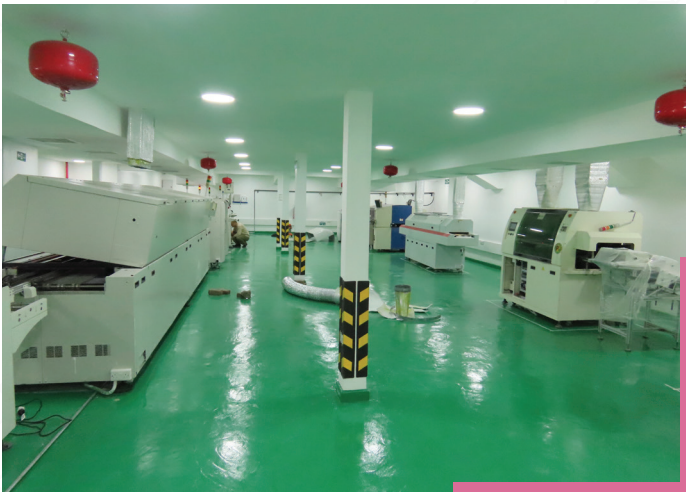
Epoxy Floor - Spearhead Factory Nairobi Industrial Area