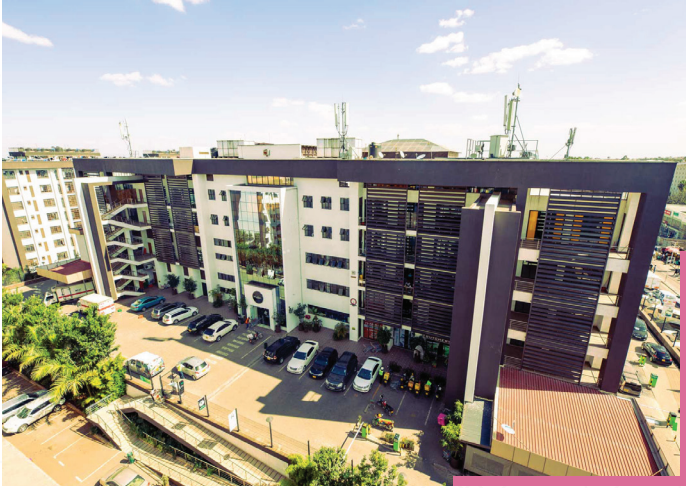
Freedom Heights Mall Langata

We understand your need for quality paint, affordable price as well as reliable service, and fast delivery; whatever your construction requirements are, or if you're looking for a special color or application, we have the products and expertise that will meet your high standards at the best price.