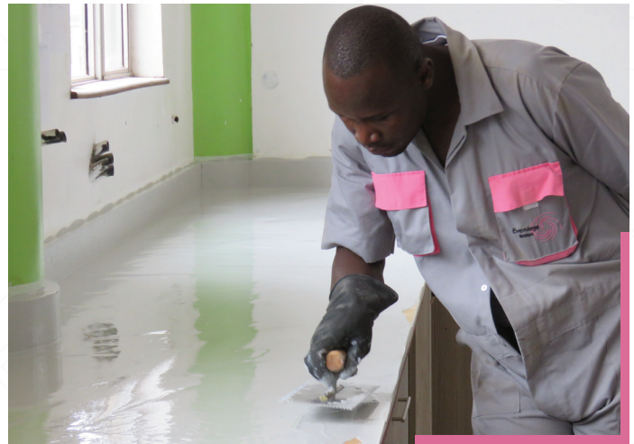
KAWI complex Table Top Epoxy Coating Nairobi South C