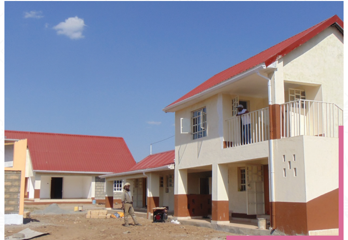
I Africa Rehabilitation Centre Nairobi Kikuyu