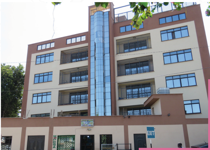
Mosco Apartments South B Nairobi