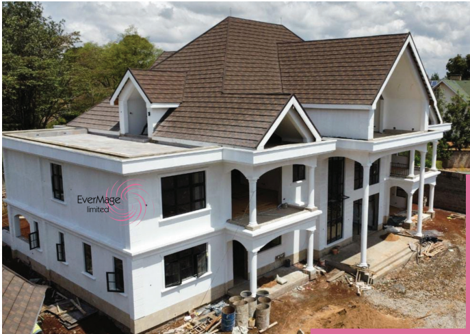
5 Bedroom Residential Unit Karen Nairobi

We are known for excellence in a diverse range of services including but not limited to all general works in building and construction, renovations, fit outs, concrete works touching on Core drilling services, flooring solutions and general repairs. We provide professional client-focused construction solutions going above and beyond on every project and deliver on our promises with integrity.