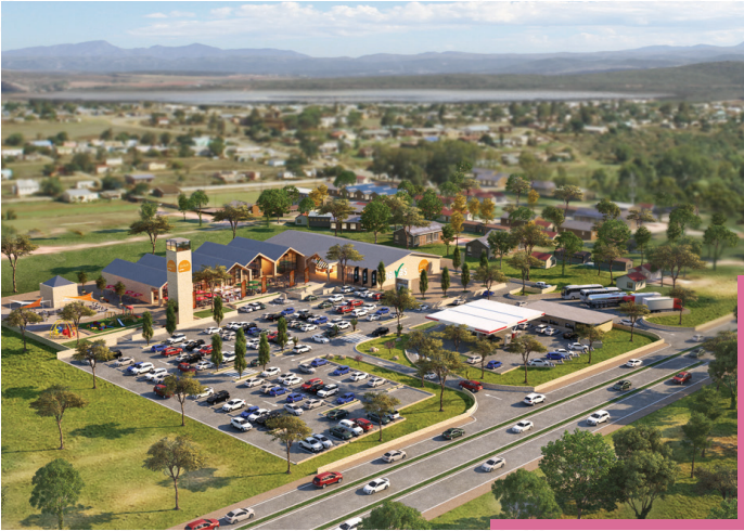
Naivasha Safari Mall - Naivasha Repairs and waterproofing 300k litres waste water tank.