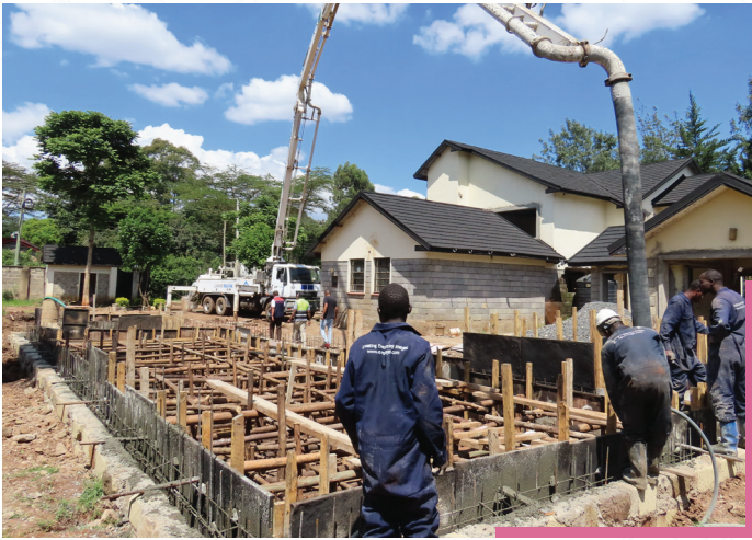
Swimming Pool Construction and General House Renovations Nairobi Karen